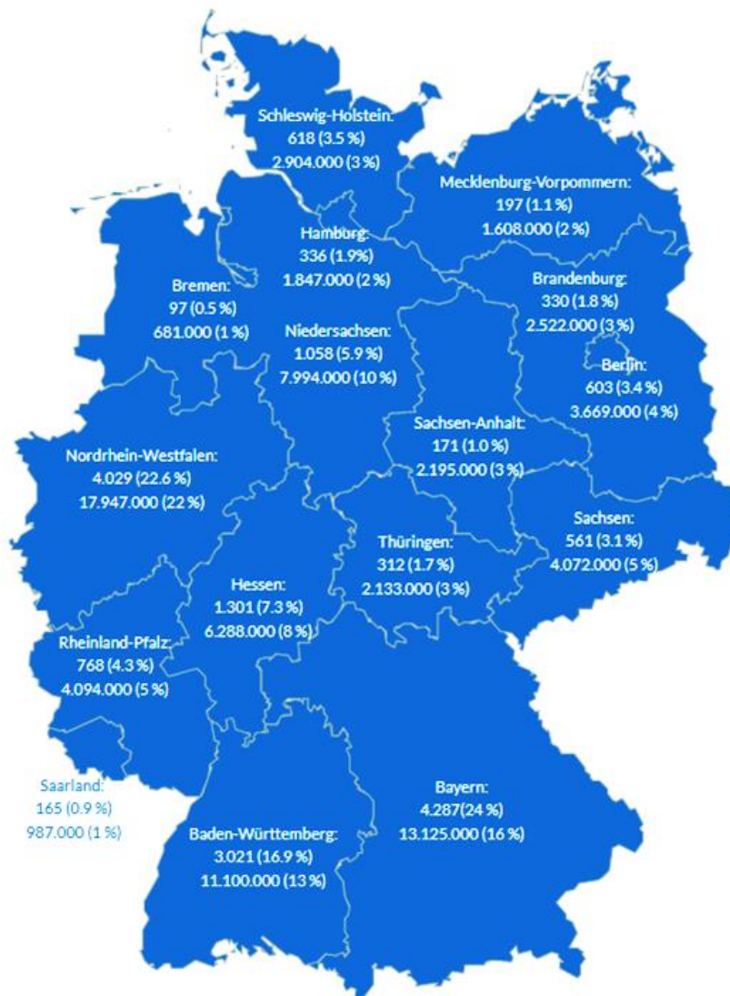
Figure 2: Distribution of participants by federal state. First row: Name of the federal state, second line: Parents in the registry, as absolute and relative frequency (as of 26.10.2020). Third line: Population in Germany in comparison, as absolute and relative frequency. The distribution of contributors corresponds approximately to the respective share of the population.

certificate, and 31 participants (0.2%) stated that they had no school or training qualification. The remaining did not enter an education. The participation of contributors per state corresponds to the distribution of the population (Figure 2).